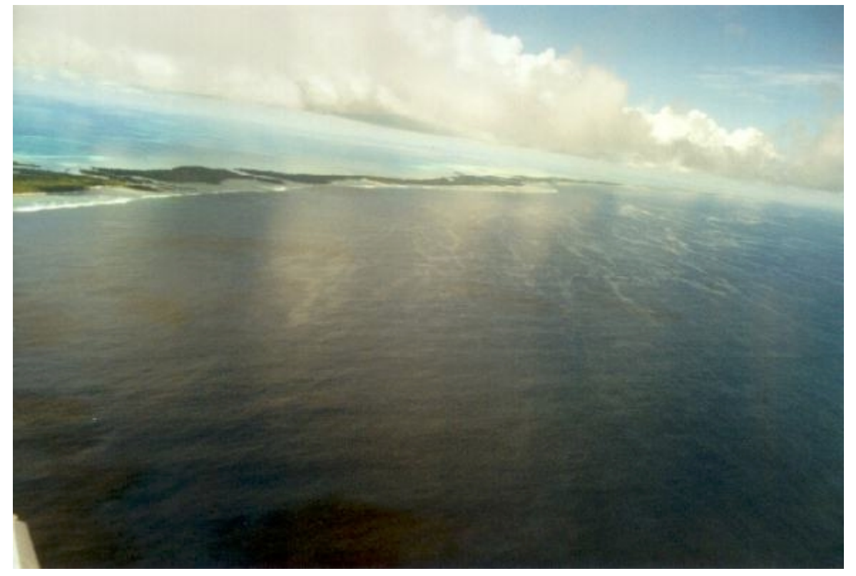
Fig.5: Atolls are most vulnerable to sea-level rise

In conclusion Kiribati atolls are most vulnerable to climate change and sea-level rise. It is most likely that complex patterns of erosion, accretion, in association also with coastal protection work, and gradual retreat along the width of the atoll, would take place. In the meantime, the atolls are vulnerable to extreme weather conditions such as storms, and drought to occur now under a reduced length of the period without rain.