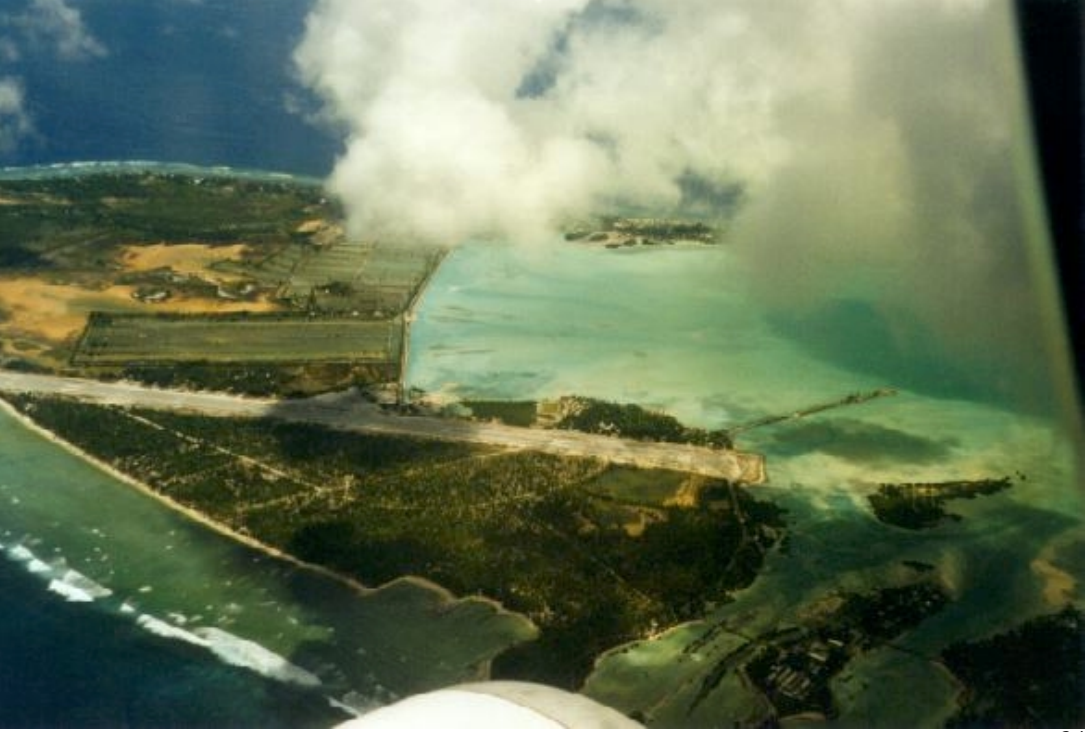
Fig.4: Coastal indeterminable boundary between land and the sea across the atoll. However, traditionally the narrow strip of land parallel to the shoreline and few meters inland is regarded as "Mataniwin te aba" which has the literal translation of "leadership land".

In summary, water lens would be affected through erosion that might be associated with sealevel rise, but intense rainfall would tend to improve the quality of the ground water lens within the atoll. There could be problem when the water lens get very close to the land surface.