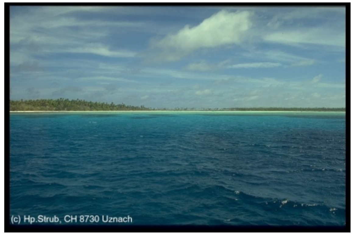
Fig.2 Atolls barely surface above the sea

*includes Ananau causeway reclaimed area.